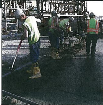
Pouring a bridge deck overlay with synthetic macrofibers.

China, and contractors began looking for an econom-